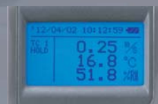
LCD display with bright backlight